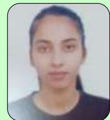
Neetu B.ED SE HI (2022-24)